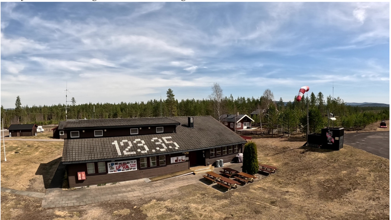
Main building with office and space for social and food