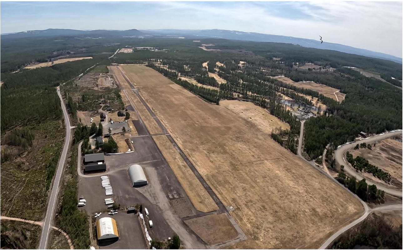
Overview looking south