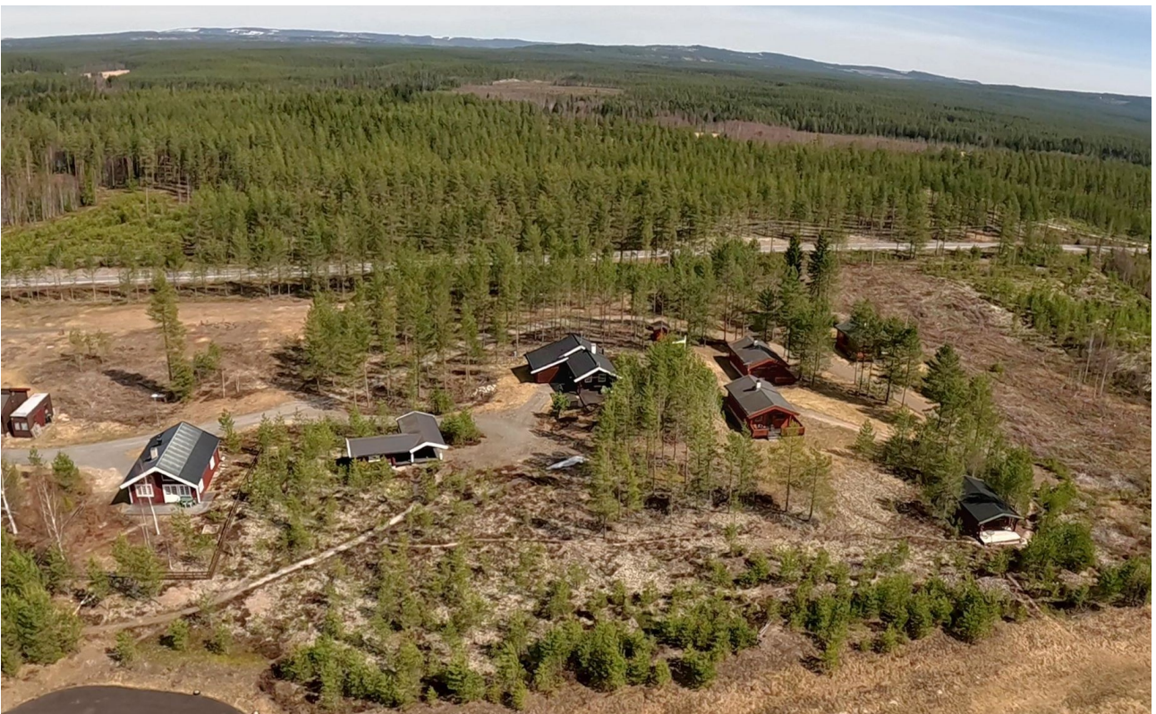
5 cabins on site available (200m from flightline)