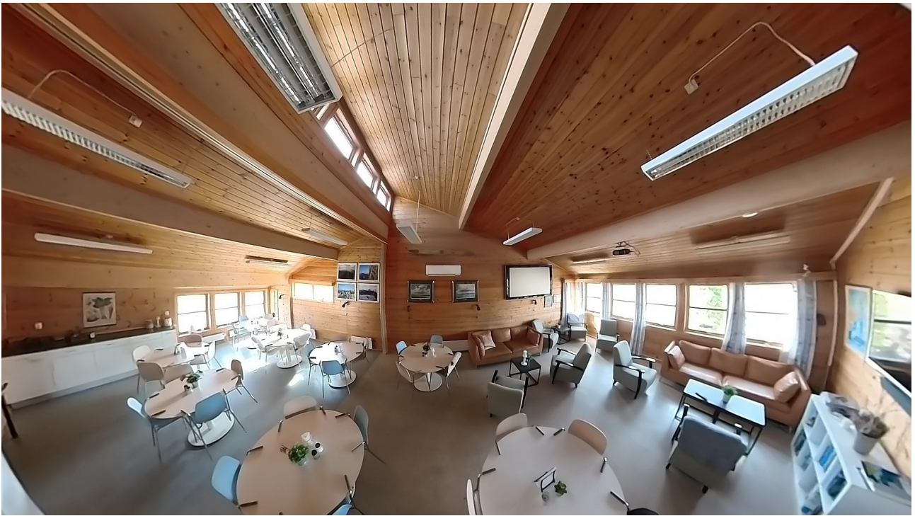
Breakfast area. With larger numbers the serving will be in tent