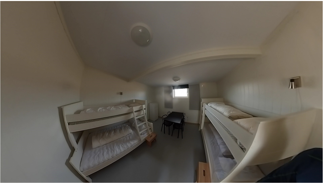
4 bed room on site