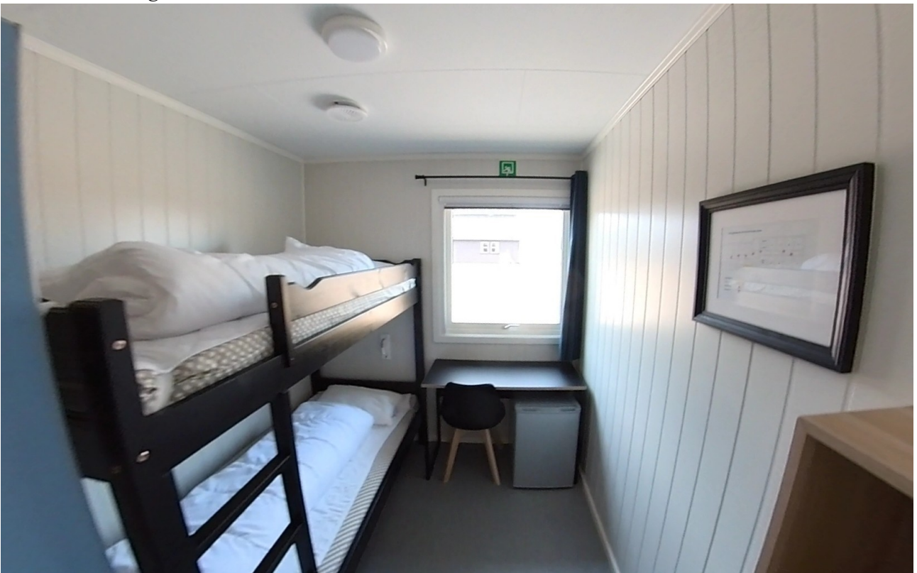
One of the 2 bed rooms available on site