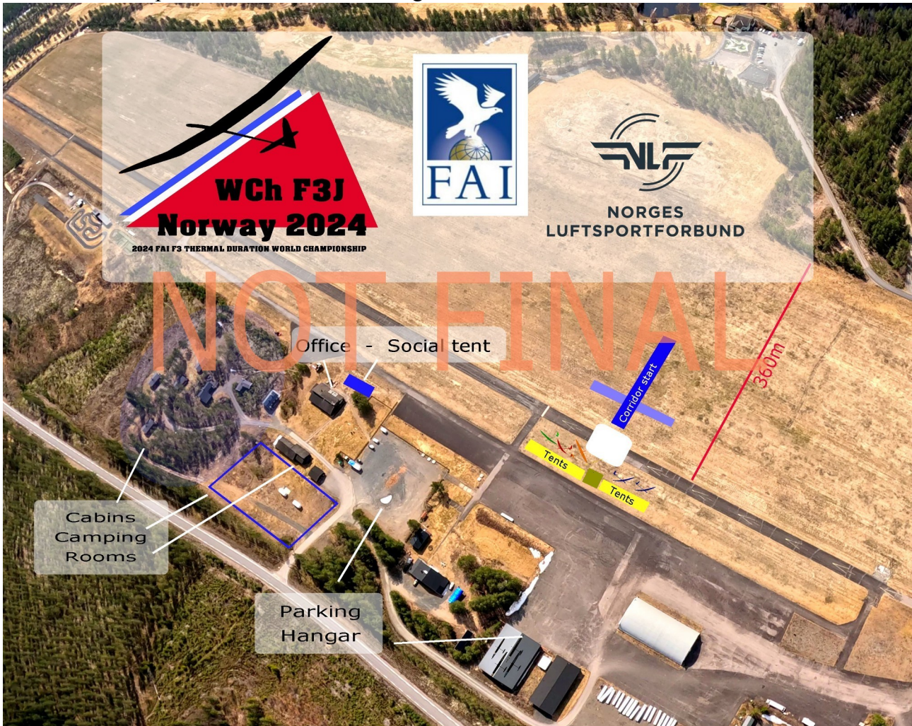
Airfield layout provisional

Single room 1 person 1495,- NKR each night incl breakfast standard room 2 persons 1795,- NKR each night incl breakfast